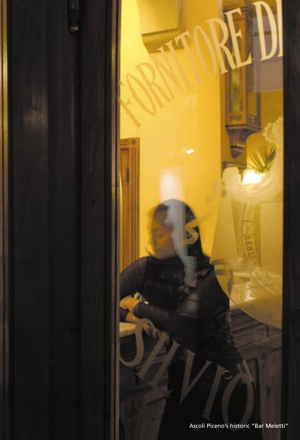
Ascoli Piceno's historic "Bar Meletti"