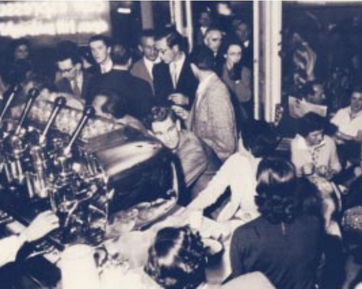
The inauguration of the Mokamba coffee bar, Knightsbridge, London 1954.