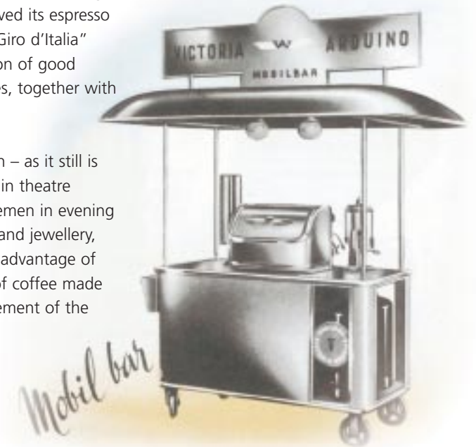
Mobil bar 1960.

In those moments the smooth surface of the machine, lightly faceted with hammer strokes, reflected the thousand kaleidoscopic forms of aristocratic female faces and smart male profiles that rose and fell in substance, governed by the multiform play of reflections that accompanied smiles and mischievous glances.