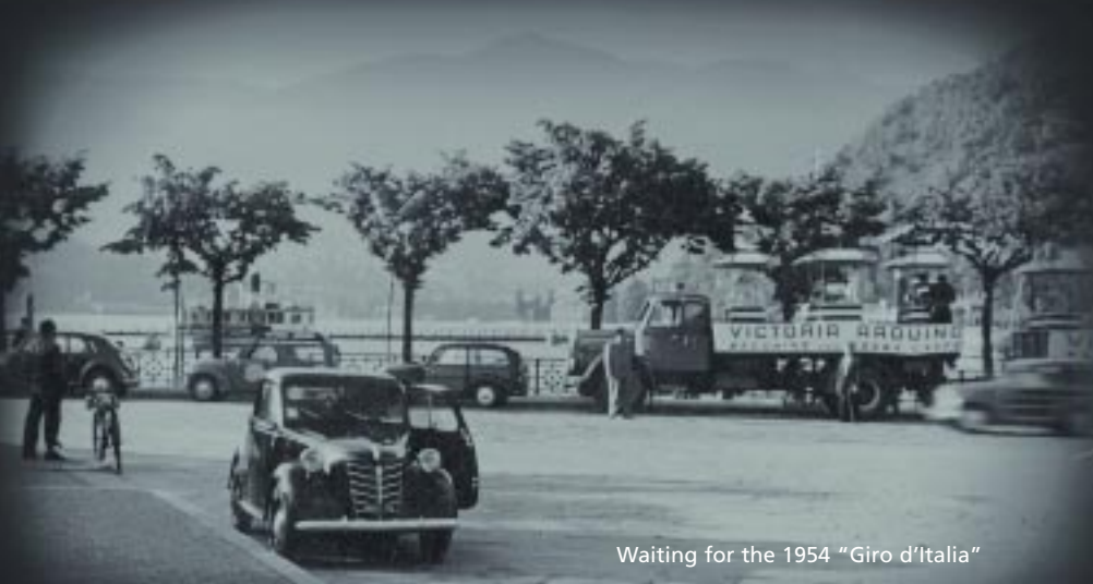
Waiting for the 1954 "Giro d'Italia"

hammered surface, the absence of any superfluous decorative element all blended perfectly with the element of tradition: the levers for dispensing coffee constitute a sort of noble crown for a machine that certainly stands amongst the elite of espresso machines.