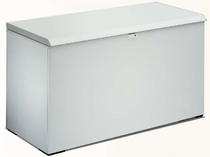
F 58 Chest Freezer