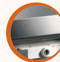
STAINLESS STEEL LID AVAILABLE*