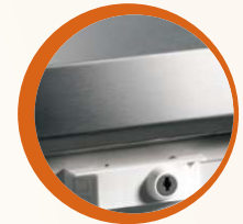
STAINLESS STEEL LID AVAILABLE*