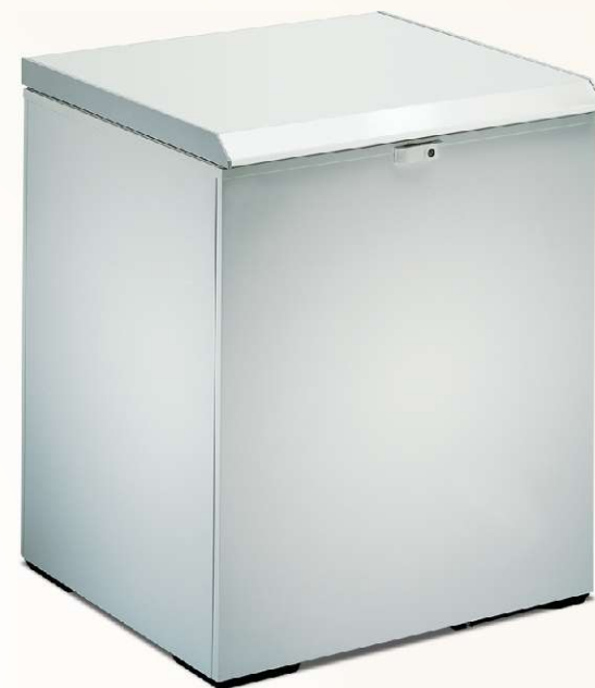
F 28 Chest Freezer