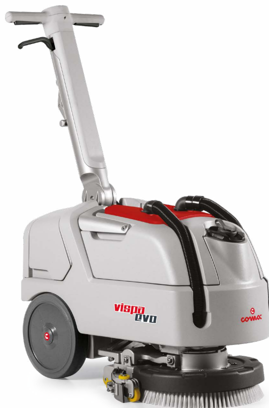
VISPA EVO B Version with disc brush Working width: 350 mm