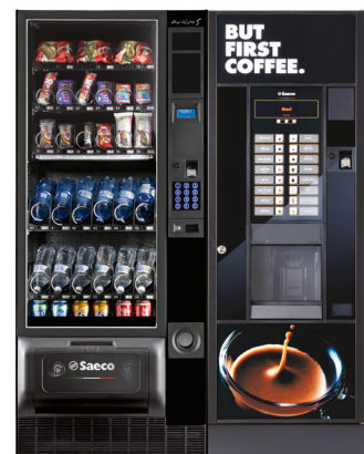
Artico S + Oasi 400