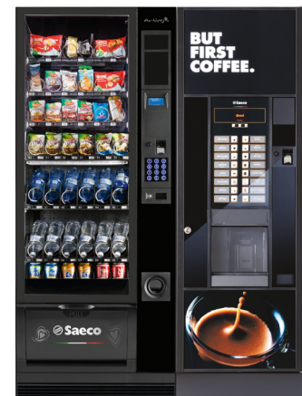
Artico M + Oasi 600