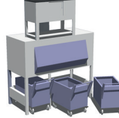
MAR 206+ITS3250 (sold separately)

This product qualifies for the following listings: