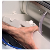
Easy to remove water sump