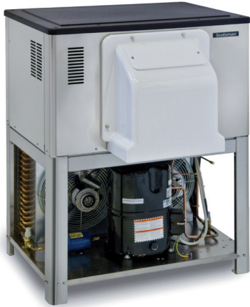
ABS Ice Chute Cover: sold separately.