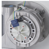
Gear box protection (hall effect)