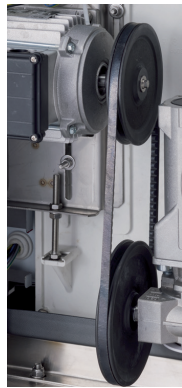
Pulleys & belt system allows to modify ice thickness