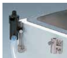
Easy to change water level by adjusting over flow