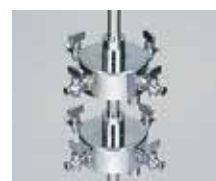
Cooling water distributor for BS401

Includes distribution pipe 2pcs., connector 4pcs., 2pcs.=1set (supply/drain). One connected to water faucet will inject water to 4 cooling water distributors.