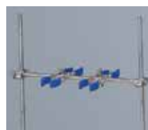
Sturdy die-cast clamps