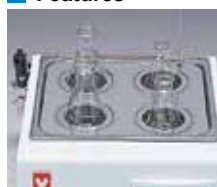
For different flask size