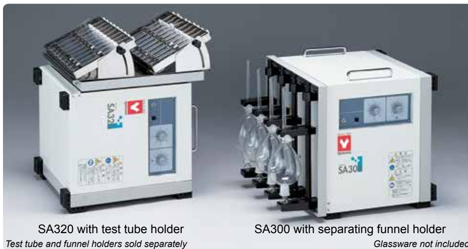
SA320 with test tube holder

Test tube and funnel holders sold separately