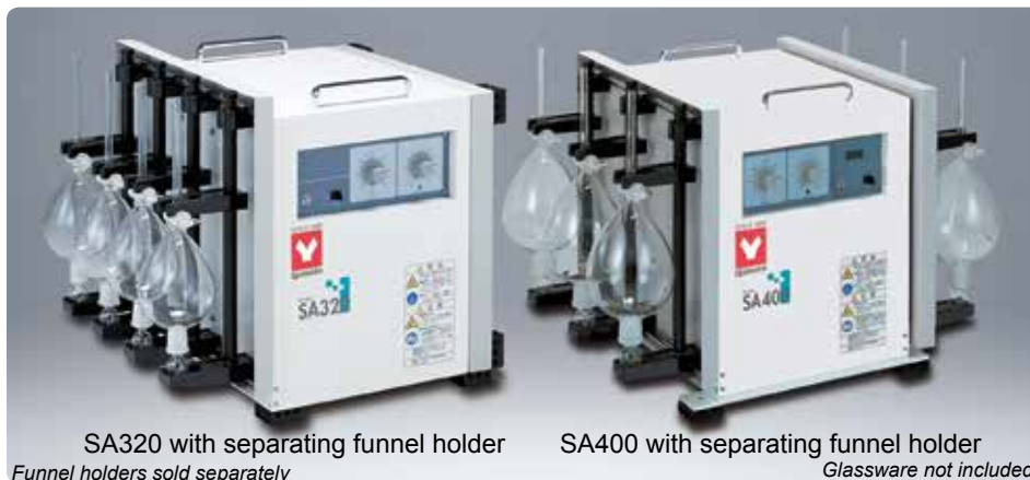
SA320 with separating funnel holder