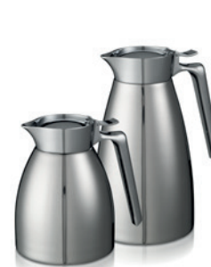
Oline stainless steel decanters

This series is developed to make maintenance quicker and easier to perform. Even the inside of the boiler is smooth.