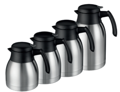
Double-walled vacuum flasks