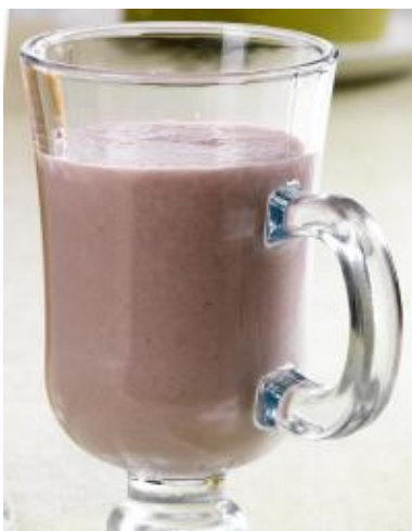
ROMANTIC STRAWBERRY SMOOTHIE

25 strawberries 2 bananas 6 T almond butter 350 ml of milk 10 pcs of ice cubes