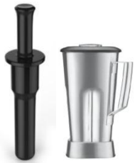
Kuvings Power Blender