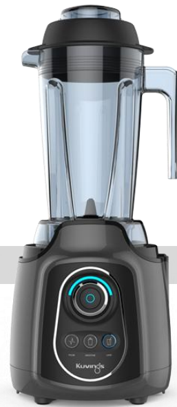
Kuvings Power Blender