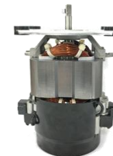
MOTOR - 9538B

220~240V, 50~60Hz 1500W (2HP, max 5HP) 4.2kg 32,000RPM