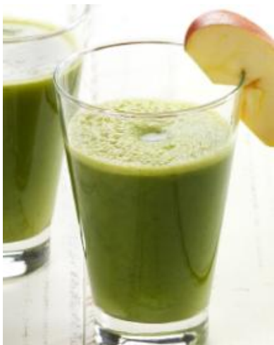
PERFECT BALANCE SMOOTHIE

50 kg of spinach 1 apple 2 bananas 30 g of lemon extract 350 ml of liquid (water, sparkling water, milk) 10 pcs of ice cubes