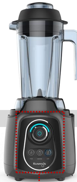
Kuvings Power Blender