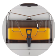
Speed S +plus Tank Podium