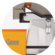
Speed S +plus Self Service