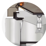
Speed S +plus Self Service Podium